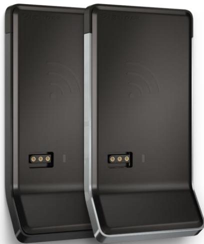
Standard With Pull