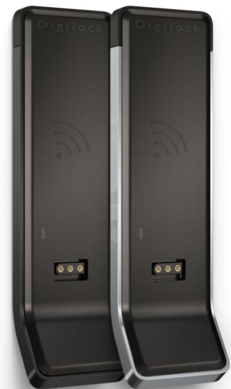
Narrow With Pull

The Narrow body style is available in both vertical and horizontal mounting options